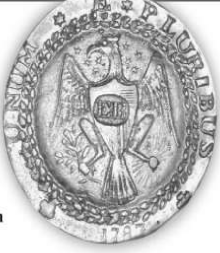
Unique 1787 "EB" on breast Brasher Doubloon from the Gold Rush Collection