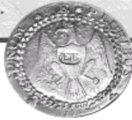
Unique, 1787 "EB" on breast Brasher Doubloon from The Gold Rush Collection

GOLD RUSH GALLERY, INC. Numismatic Excellence Since 1968