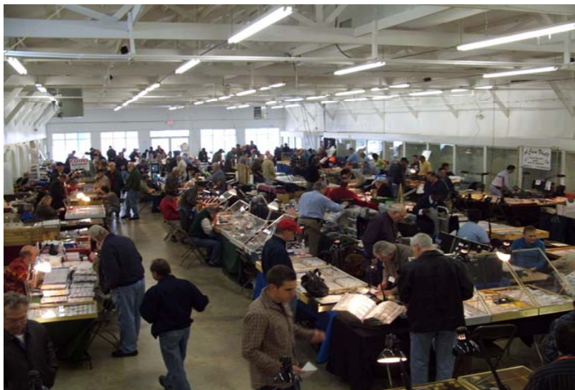
Bourse Floor at the Low Country Coin Club's Winter Coin Show