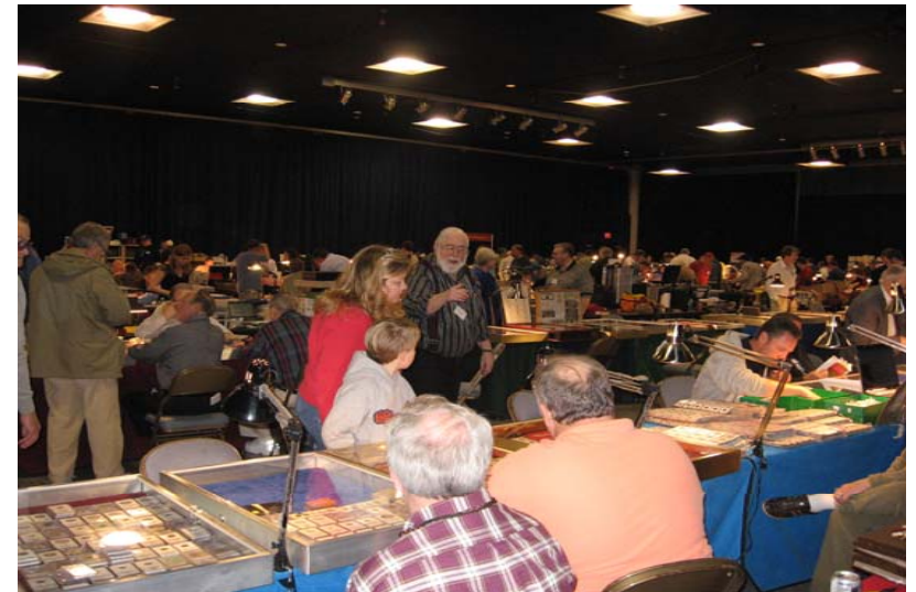
An Active Bourse Floor at the Upstate South Carolina 37 th Annual Coin Show